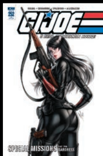
Cover RE KRS Comics