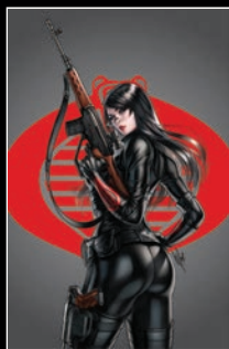
Cover RE KRS Comics