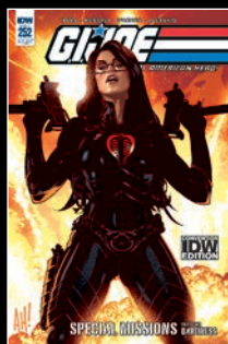
IDW Con Variant Cover