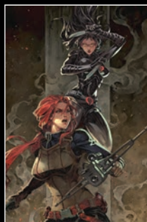
Cover RE Comic Market Street

Art by Kael Ngu www.comicmarketstreet.com