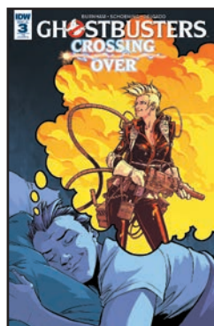
RETAILER INCENTIVE COVER