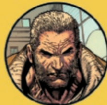
OLD MAN LOGAN