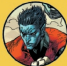
NIGHTCRAWLER KURT WAGNER