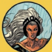
STORM ORORO MUNRAE