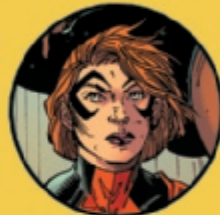
PRESTIGE RACHEL GREY