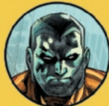
COLOSSUS PIOTR RASPUTIN