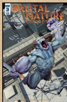
SUBSCRIPTION COVER ART BY ARIEL OLIVETTI

For international rights, contact licensing@idwpublishing.com