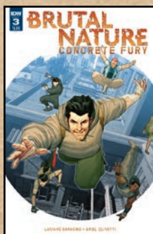
REGULAR COVER ART BY ARIEL OLIVETTI