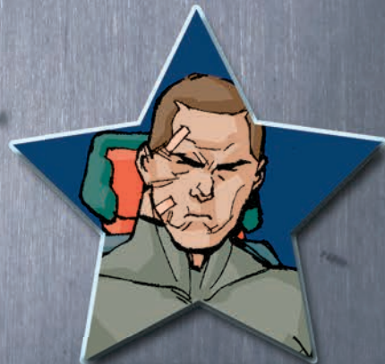
GRAND SLAM Research & Development