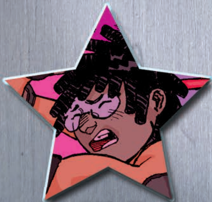
DOC JR. Dire Wraith/Human Hybrid