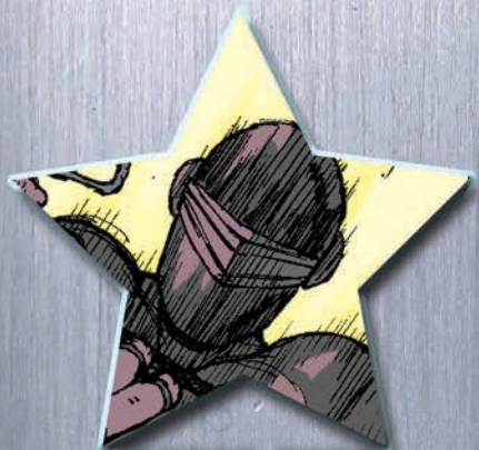
SNAKE EYES Ninja Commando