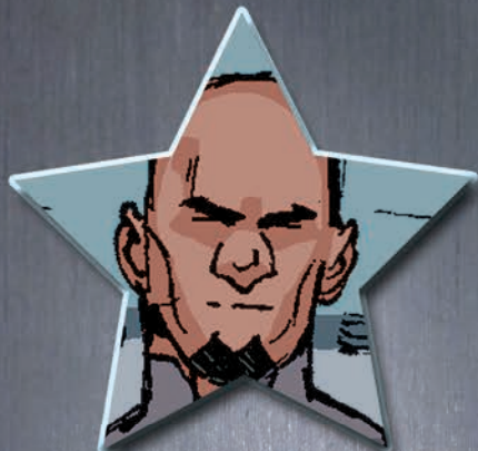
ROADBLOCK Field Commander