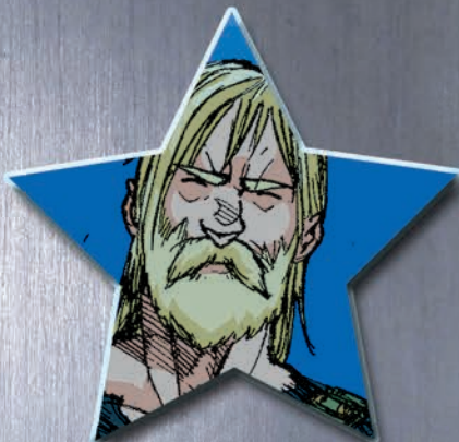
ROCK 'N ROLL Shotgun Specialist