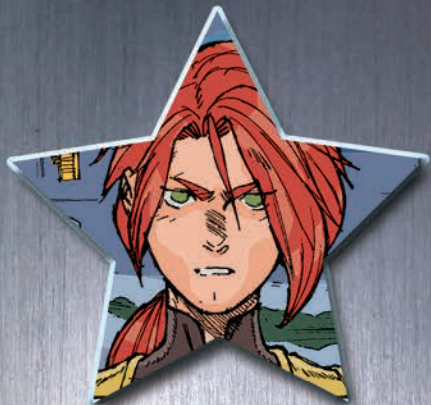
SCARLETT G.I. Joe Commander