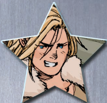
COVER GIRL Heavy Ordnance Driver