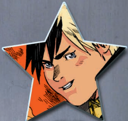
HELIX Special Operations