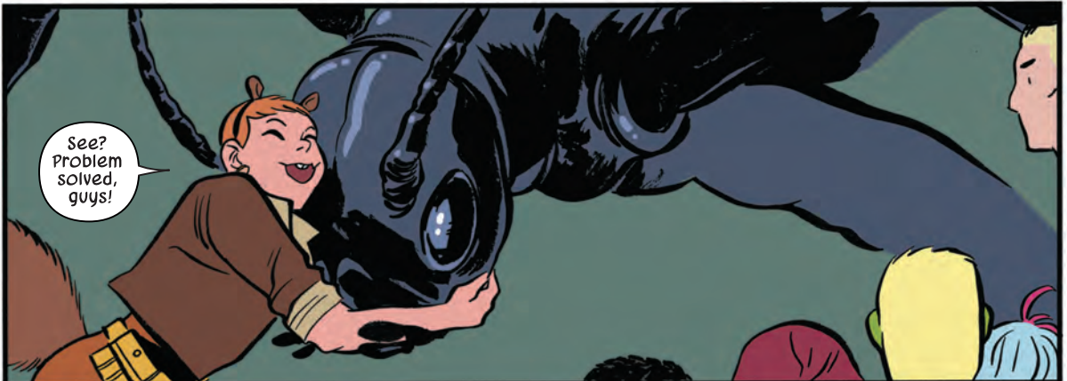
Tree lobsters are the cutest . They pair off in couples and follow each other around, and when they sleep they cuddle up together so that one insect's legs protectively cover the other. They're insects that spoon each other, it's the cutest --I love you, tree lobsters!