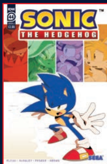
COVER A ART BY GIGI DUTREIX