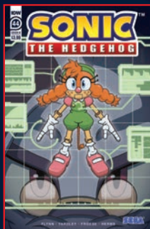
COVER B ART BY JAMAL PEPPERS