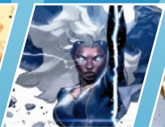
STORM THEY'RE THE GODDESSES OF THE SKIES.