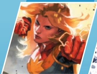
CAPTAIN MARVEL THEY'RE THE BOSSSES OF SPACE.