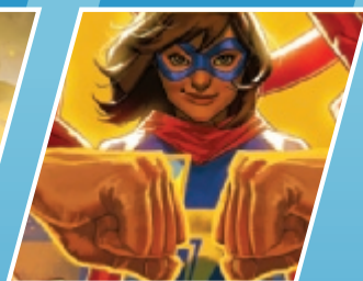
MS. MARVEL THEY'RE THE GUARDIANS OF THEIR HOMETOWNS.