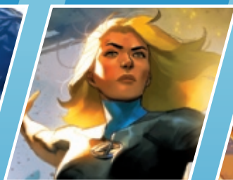
INVISIBLE WOMAN THEY'RE THE PROTECTORS OF THE PLANET.