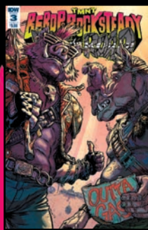
Cover B Art by Ryan Browne