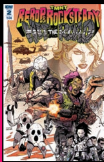
Cover B Art by Dustin Weaver