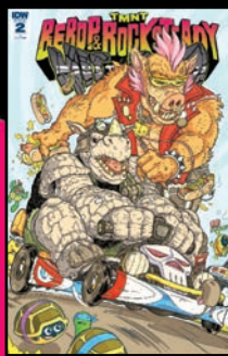
Cover RI-A Art by Ulises Farinas