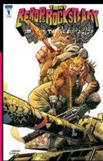
Cover RI-A Art by Cory Smith Colors by Brittany Peer