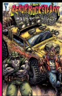
Cover RI-B Art by Kevin Eastman Colors by Tomi Vargas