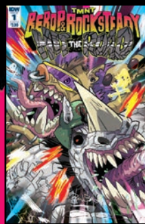
Cover B Art by Ben Bates