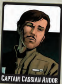
CAPTAIN CASSIAN ANDOR