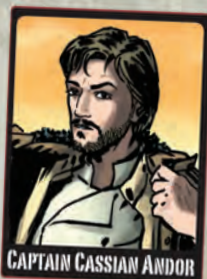
CAPTAIN CASSIAN ANDOR

Rebel intelligence officer Cassian Andor rebel spies Kertas and Rismor.