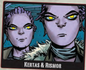
KERTAS & RISMOR