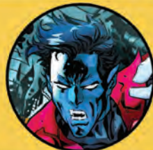
NIGHTCRAWLER KURT WAGNER