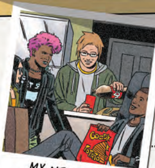
MY NEW FRIENDS