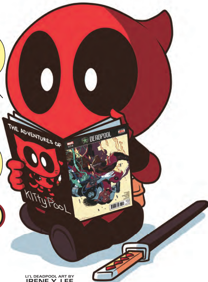
L'I'L DEADPOOL ART BY IRENE Y. LEE

SO...HAIL HYDRA AND ALL THAT. YEAH, THAT'S RIGHT. I WORK FOR HYDRA STILL. THAT'S WHAT YOU GET FOR TRUSTING CAPTAIN AMERICA, APPARENTLY-- HE TURNS OUT TO BE A SECRET HYDRA AGENT AND SUDDENLY YOU'RE ON THE WRONG SIDE OF HISTORY. JUST BECAUSE YOU KILLED A COUPLE OF YOUR FRIENDS ON HIS SAY-SO. IT'S OKAY, THOUGH--I'VE GOT A PLAN. I'M TASKED WITH BRINGING IN MEMBERS OF THE SUPER HERO RESISTANCE...BUT I'VE BEEN FOCUSING ON THE DUDS. I EVEN USED MY SUPER-WILY PLANNING TO FIGURE OUT WHERE STEVE ROGERS HAS BEEN KEEPING BLACKOUT, WHO TRAPPED A BUNCH OF THE GOOD GUYS IN THE DARK DIMENSION! AND I KNOW JUST WHAT TO DO WITH THAT INFO... OH, ALSO-- THIS ISSUE CONTAINS SPOILERS FOR SECRET EMPIRE #10! BUT, HEY! FROM A CERTAIN POINT OF VIEW, THAT ISSUE CONTAINS SPOILERS FOR THIS ONE, TOO. SO...ADJUST YOUR READ ORDER ACCORDINGLY.