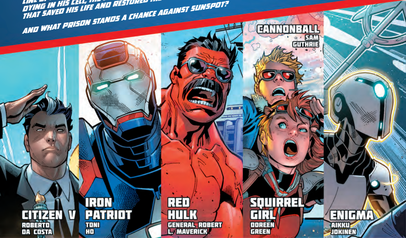
CITIZEN V ROBERTO DA COSTA

AND WHAT PRISON STANDS A CHANCE AGAINST SUNSPOT?