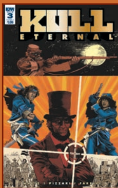
COVER A Art by Luca Pizzari