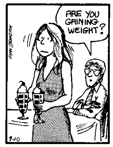
An actual quote and an actual scenario. — LJ