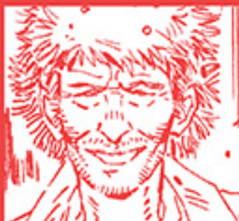
THE PRANK ADDICT Remnant. Hospitalized. Faking amnesia.