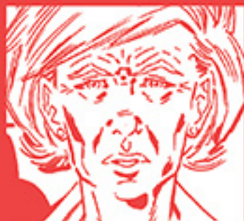
QUINN Mentor. Puppet master. Deceased.