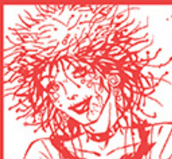
THE BONE COLLECTOR Seductive. Strange. Saturn's Most Wanted.