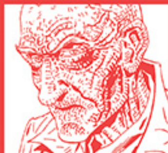
THE OLD MAN Gangster. Weary. Deceased.