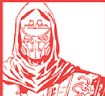
MAGHAZO Terror herald. The right hand of doom.