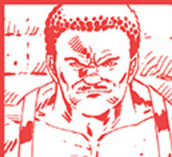
SKYSCRAPER Break muscle. Big. Befuddled.