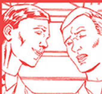
THE ALPHA BROS. Cha Cha & Dolph. Criminal. Ambiguous.