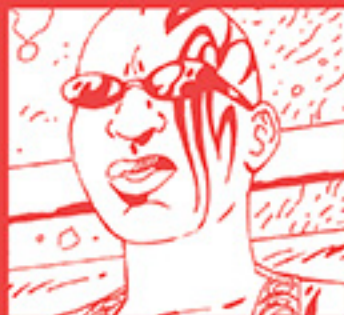
MASAI Break. Boss. Bad ass.