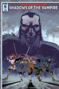
SUBSCRIPTION COVER art by Nelson Dániel