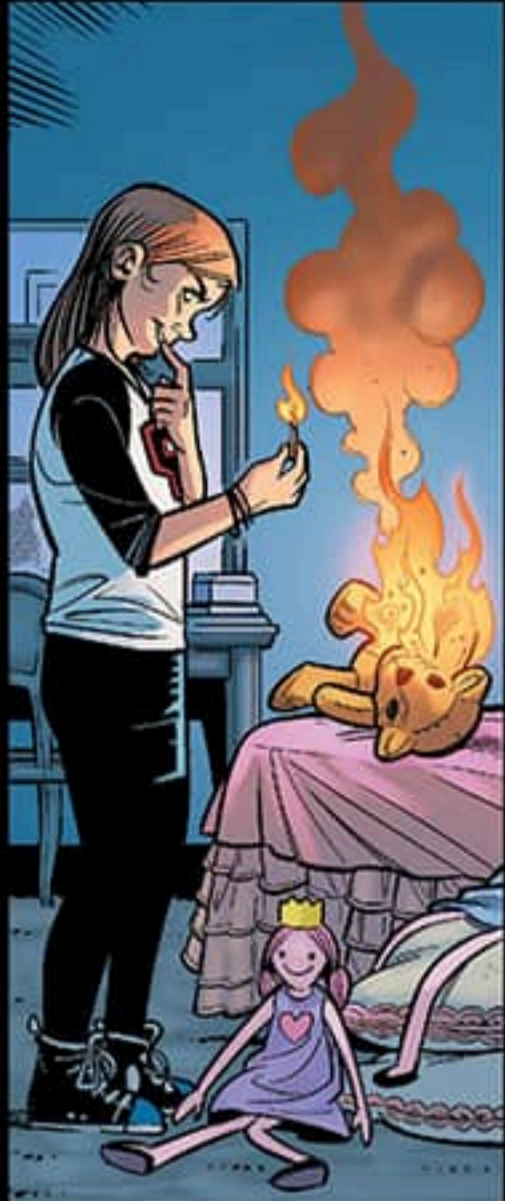
Don't think I really understood why at the time, why I started that fire...