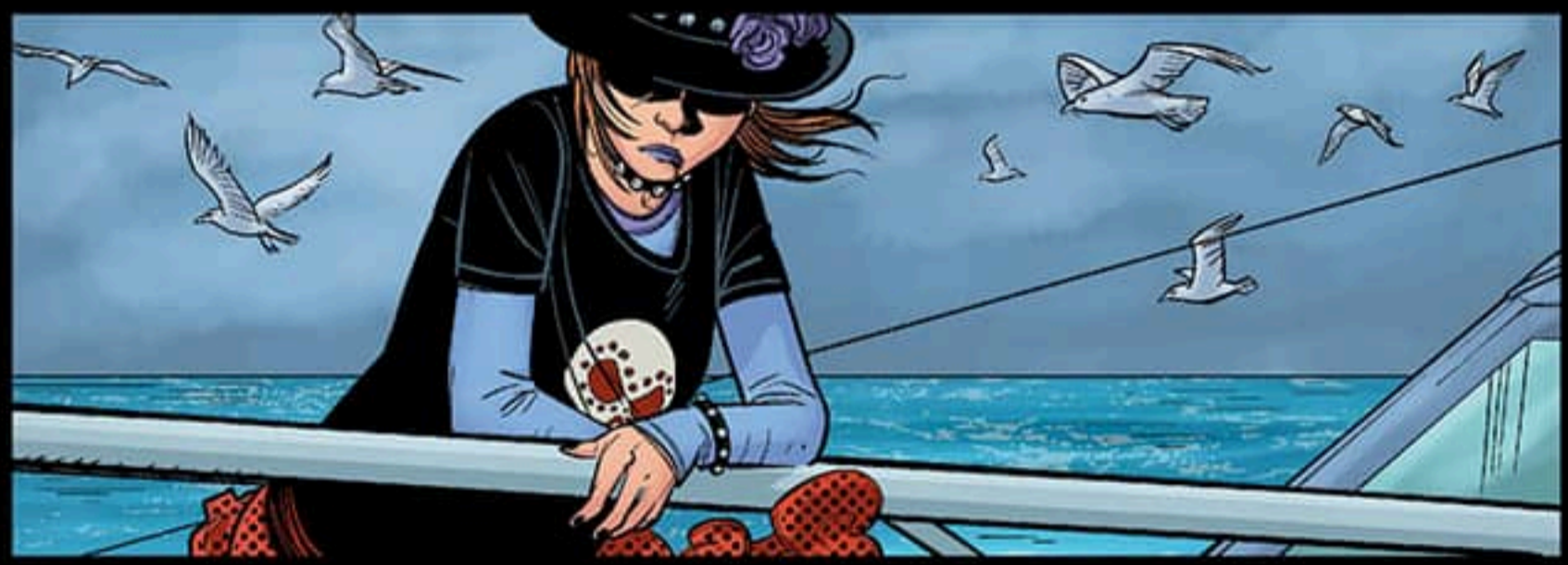
I was taken away and brought to a new place to live--one without my parents.