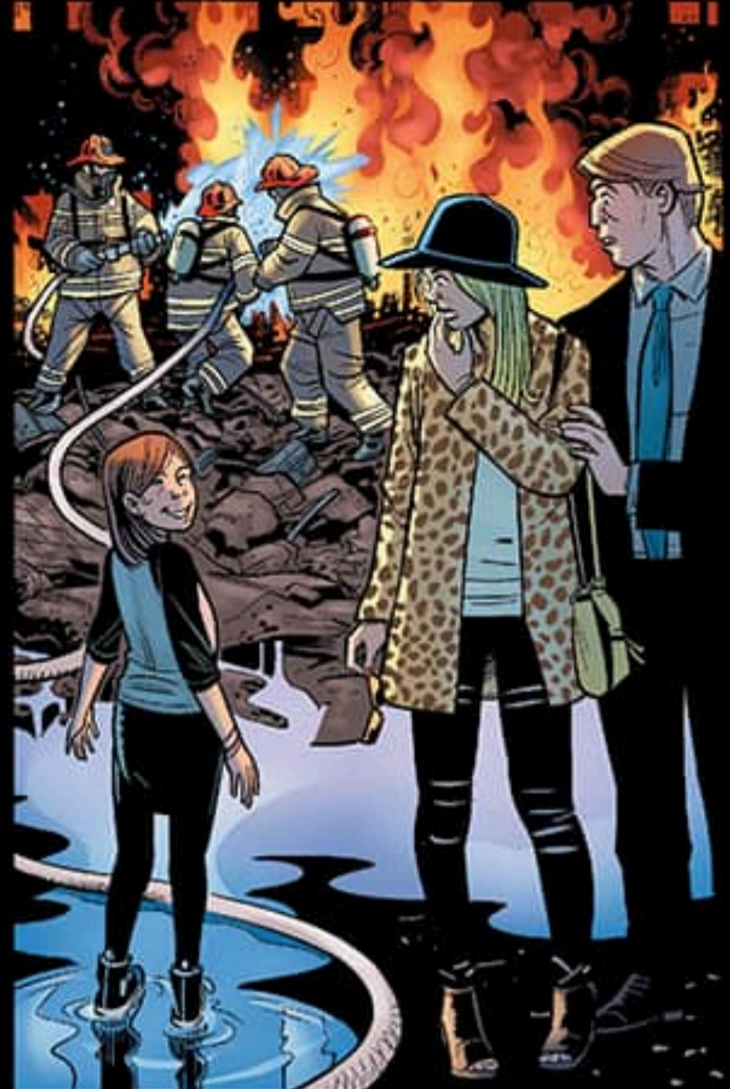
But it burned down the entire building and two people died in the blaze.