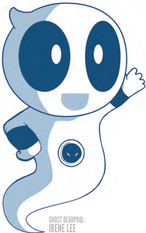
GHOST DEADPOOL: IRENE LEE