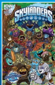
SUBSCRIPTION COVER art by JACK LAWRENCE