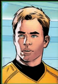
JAMES T. KIRK Captain of the Federation flagship U.S.S. Enterprise