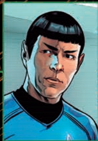
SPOCK First Officer of the U.S.S. Enterprise