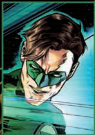
HAL JORDAN Green Lantern of Space Sector 2814