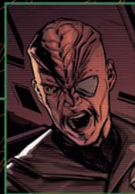
CHANG Captain of the Klingon Bird of Prey Mug'tovar