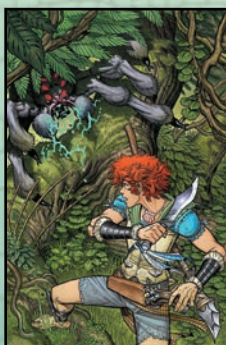
COVER RI-A ART BY NICK BRADSHAW COLORS BY LEN O'GRADY