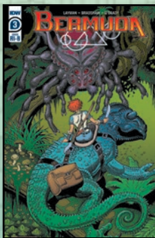
COVER RI-B ART BY WILLIAM STOUT COLORS BY LEN O'GRADY