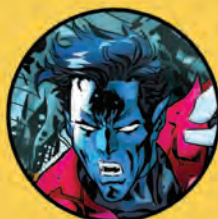
NIGHTCRAWLER KURT WAGNER