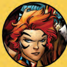
PRESTIGE RACHEL GREY