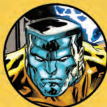
COLOSSUS PIOTR RASPUTIN