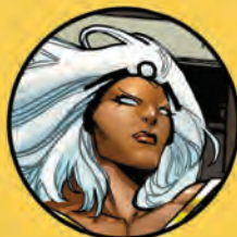
STORM ORORO MUNROE