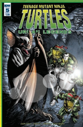
Cover A Art by Frank Fosco Colors by Courtland Bruggar