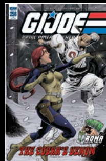
Cover RE Tri-State Comic Con Art by Tristan Kelly Colors by Nick Wentland