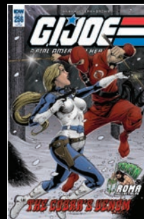
Cover RE Tri-State Comic Con Art by Tristan Kelly Colors by Nick Wentland