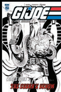
Cover RE Comics Vault Art by Gus Mauk