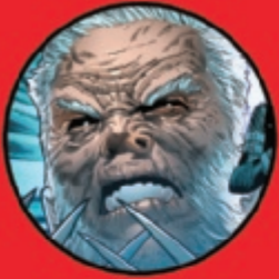
OLD MAN LOGAN