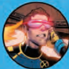
CYCLOPS SCOTT SUMMERS