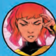
MARVEL GIRL JEAN GREY