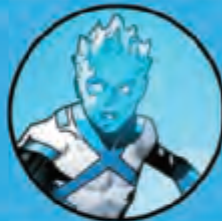
ICEMAN BOBBY DRAKE