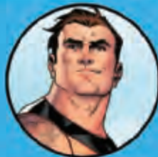
BEAST HANK McCOY