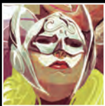
THOR Jane Foster