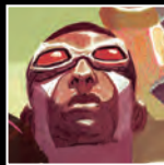
CAPTAIN AMERICA Sam Wilson