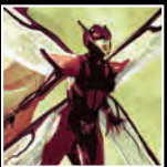
WASP Nadia Pym