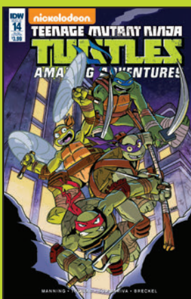
Subscription Cover Art by Ryan Jampole