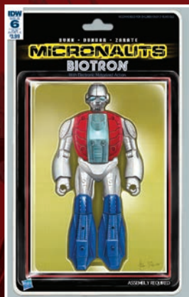
SUBSCRIPTION COVER C

ACTION FIGURE PHOTO Toy courtesy MARK YTURRALDE