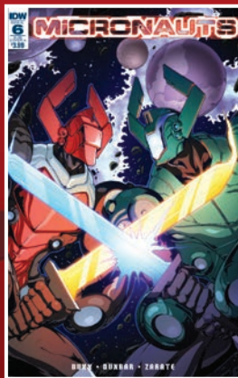
SUBSCRIPTION COVER A