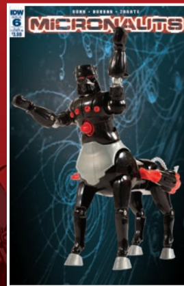
SUBSCRIPTION COVER B