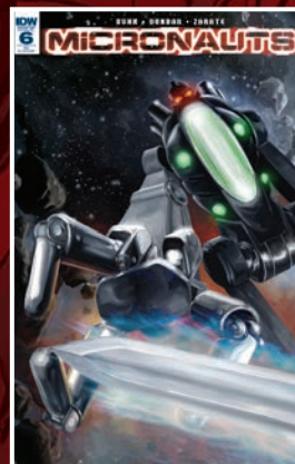
RETAILER INCENTIVE COVER