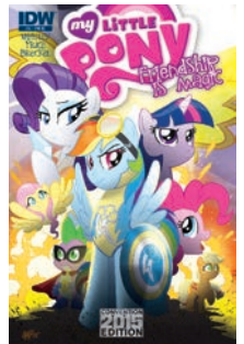
SALT LAKE COMIC-CON www.saltlakecomiccon.com