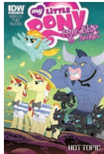
HOT TOPIC www.hottopic.com