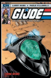
Subscription Cover Art by S L Gallant Colors by J. Brown