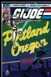
Retailer Exclusive Cover-A Rose City Comic Con Art by Jeffrey Veregge