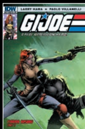
Regular Cover Art by Paolo Villanelli