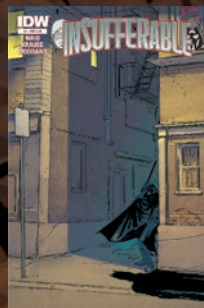
SUB COVER PETER KRAUSE