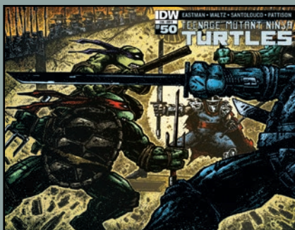
Cover B Art by Kevin Eastman Colors by Ronda Pattison