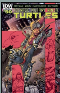
Cover A Art by Mateus Santolouco