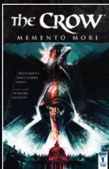
Cover B Art by Davide Furnò