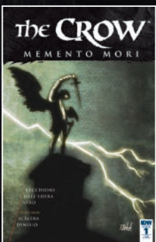
Retailer Incentive Cover B Art by Roberto Recchioni