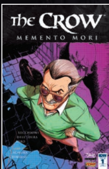
Retailer Exclusive Cover Art by Drew Moss

For international rights, contact licensing@idwpublishing.com