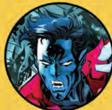
NIGHTCRAWLER KURT WAGNER