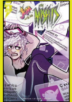
SUBSCRIPTION COVER ART BY JENN ST-ONGE