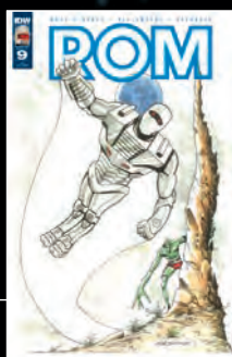
RETAILER INCENTIVE COVER Art by Joe Sinnott