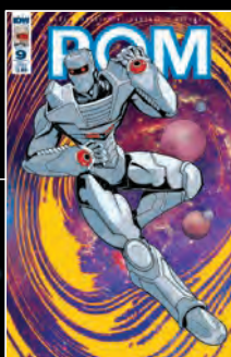
SUBSCRIPTION COVER Art by Hal Laren Colors by Lovren Kindzierski