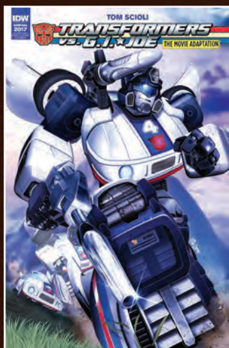
AOD COLLECTABLES EXCLUSIVE COVER Artwork by Hal Laren