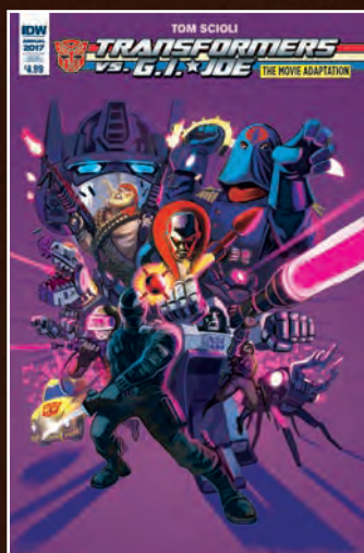
SUBSCRIPTION COVER Artwork by Robb Waters