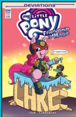
SUBSCRIPTION COVER art by Katie Cook