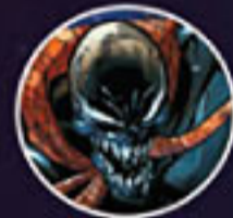
VENOM (EDDIE BROCK)