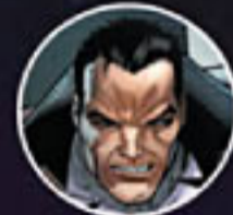
PUNISHER 2099 (JAKE GALLOWAY)