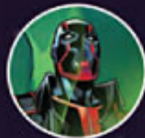
NIGHT THRASHER (DWAYNE TAYLOR)