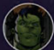
HULK (RICK JONES)