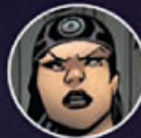
BULLSEYE (ELEKTRA NATCHIOS)