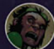
MOON BOY AGENT OF HYDRA