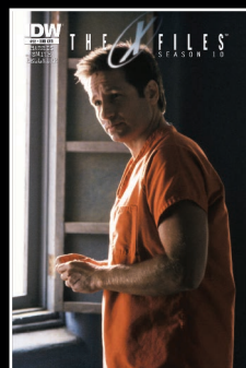
SUBSCRIPTION COVER Photo Cover