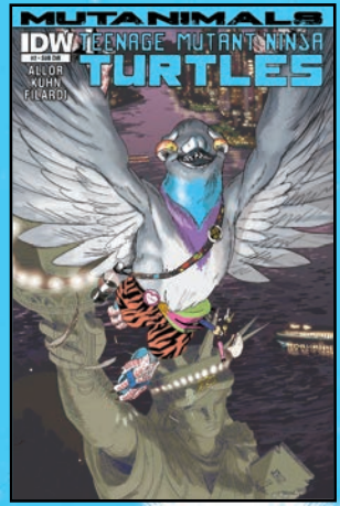
Subscription Cover Art by Ben Bates