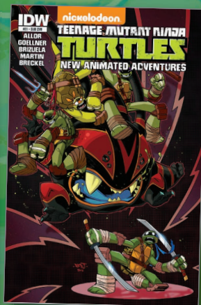
Subscription Cover Art by Jon Sommariva