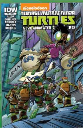
Regular Cover Art by Dario Brizuela