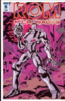
COVER B (A) COREY LEWIS