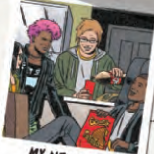
MY NEW FRIENDS