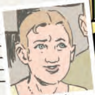
MISSING PERSON: REBECCA BROWN

After wrapping my first case in L.A. (using a bow and arrow, the power of song and a whole lot of sass, I single-handedly took down a hatermonger with mind-control abilities...okay I had a little help from my friends), I was pleasantly surprised to find my friend and mentor Jessica Jones at my new home/place of business.